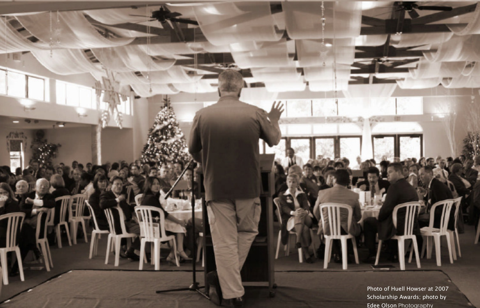
Photo of Huell Howser at 2007 Scholarship Awards; photo by Edee Olson Photography